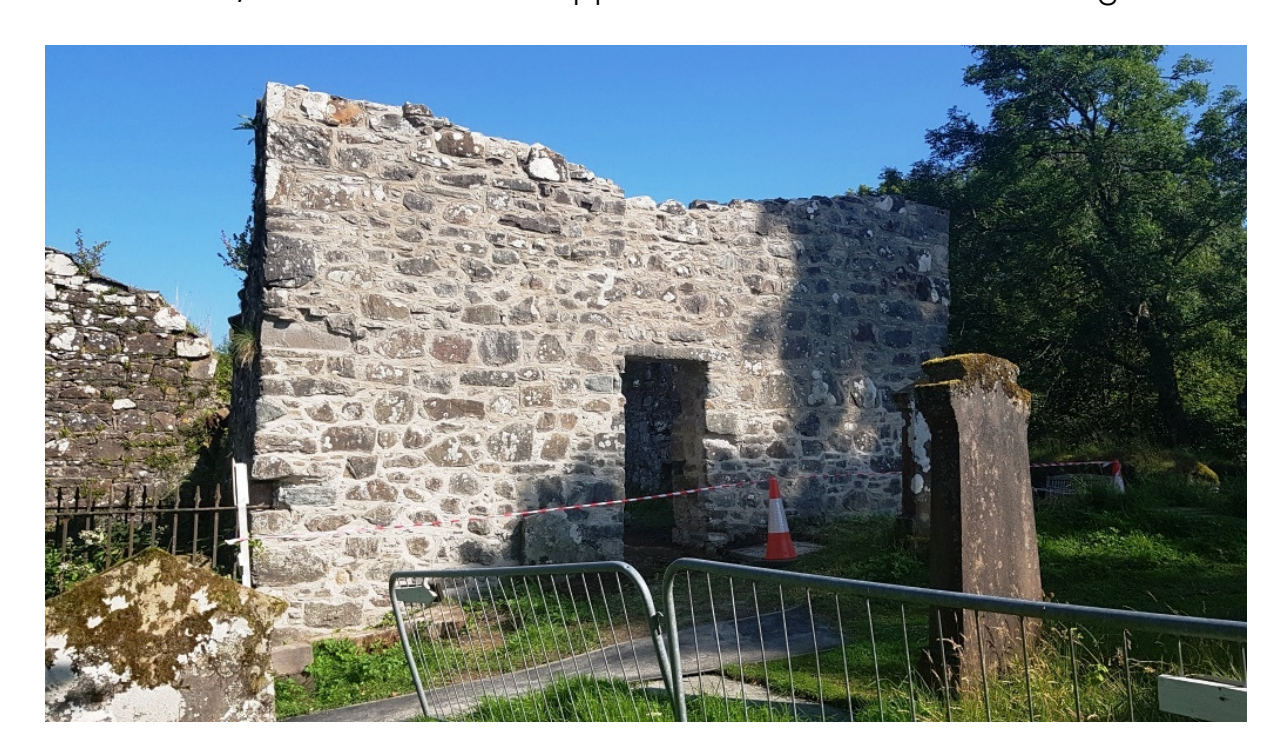
West gable external face

St Astier lime/sand mix has been applied to the external face of the gable.