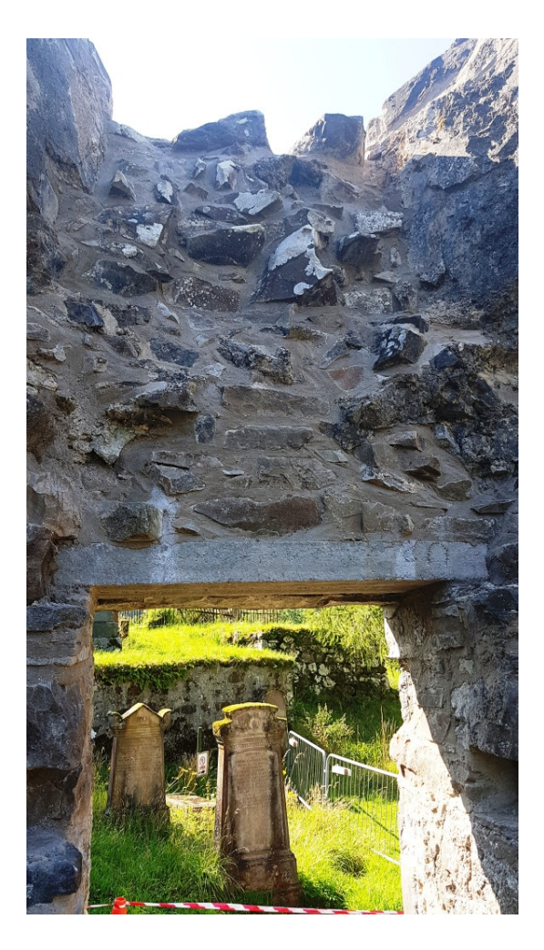
Concrete lintols below inner face

It was found necessary to install 2 concrete lintols to support the inner face of the upper wall.