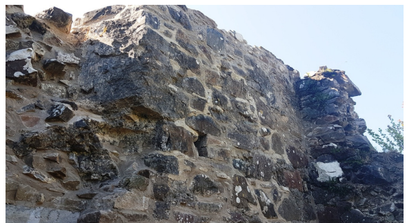
Joist dooks either side of opening internal face

The wallhead has been covered with a rough raking stone cap.