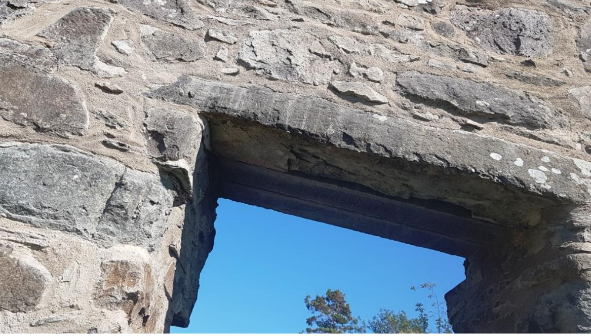
Door jambs and lintol, external face