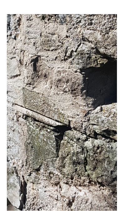
Evidence of window opening before creation of door